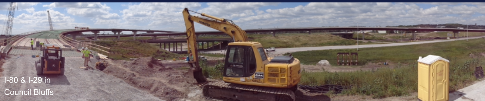
I-80 & I-29 in Council Bluffs