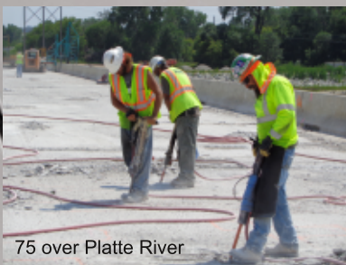
75 over Platte River