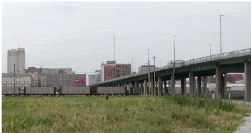
HARRIS OVERPASS, LINCOLN, NE REPLACE 1900' VIADUCT CONTRACT: $18,000,000 START: 11-12-07