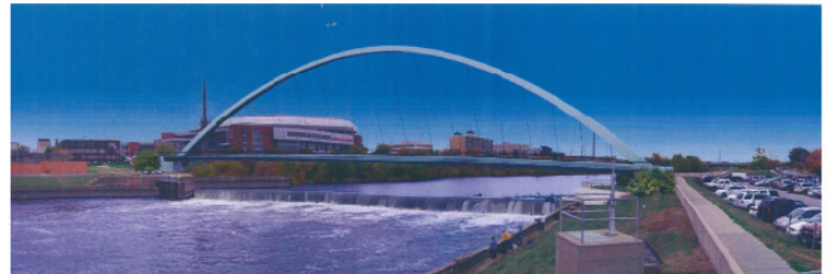
CENTER ST ARCHED PED BRIDGE, DSM, IA NEW 400' STEEL ARCH CONTRACT: $9,500,000 START: 8-15-07